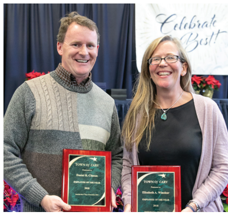
"Employee of the Year" at www.townofcary.org